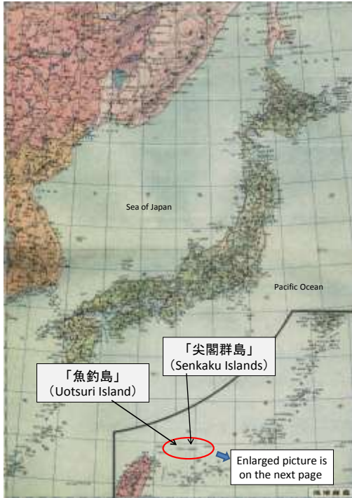
"World Atlas" published in China in 1958 (second printing in 1960) treats the Senkaku Islands as part of Japan